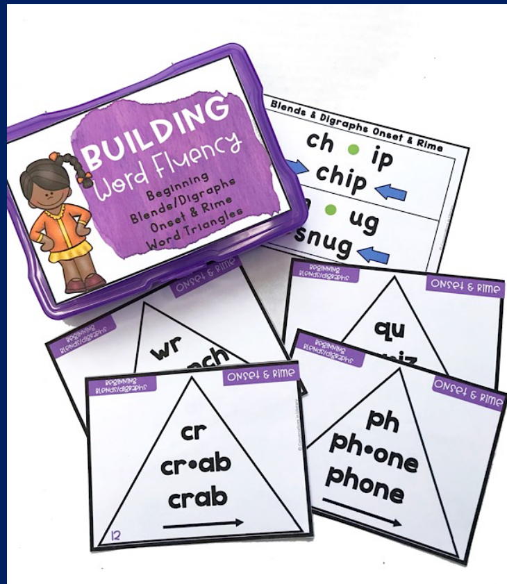
Blends & Digraphs Word Triangles